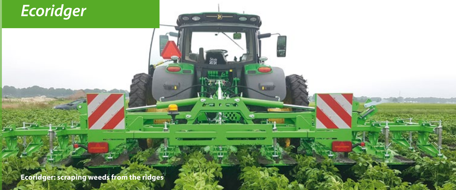
Ecoridger: scraping weeds from the ridges