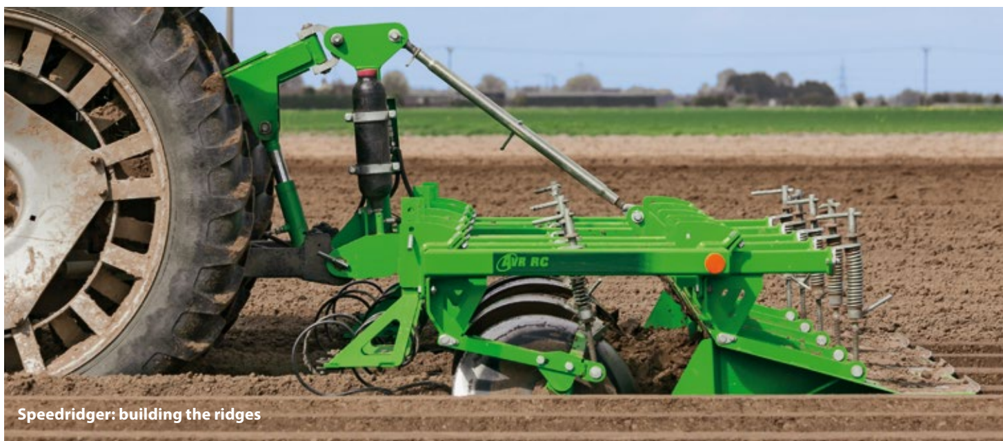
Speedridger: building the ridges