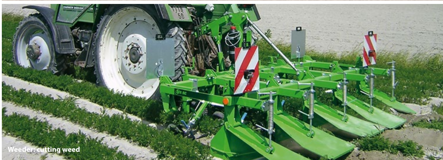
Weeder: cutting weed